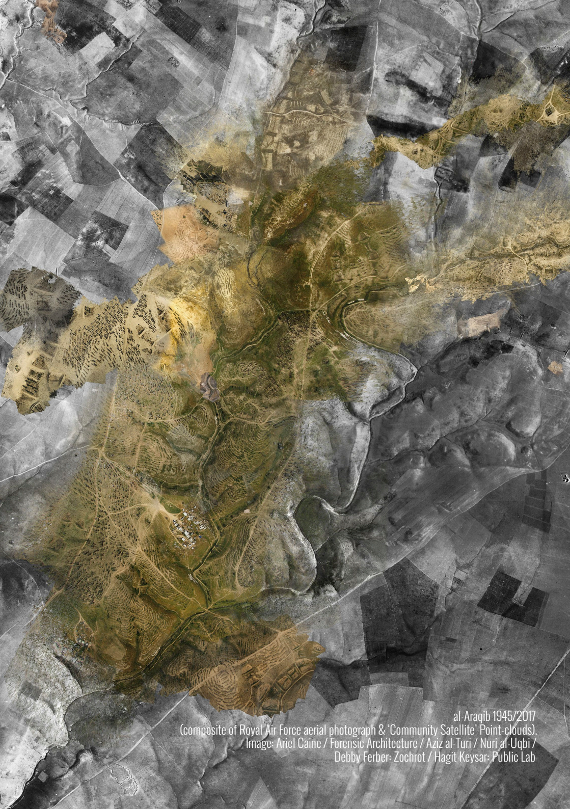
al-Araqib 1945/2017 (composite of Royal Air Force aerial photograph & 'Community Satellite' point clouds).