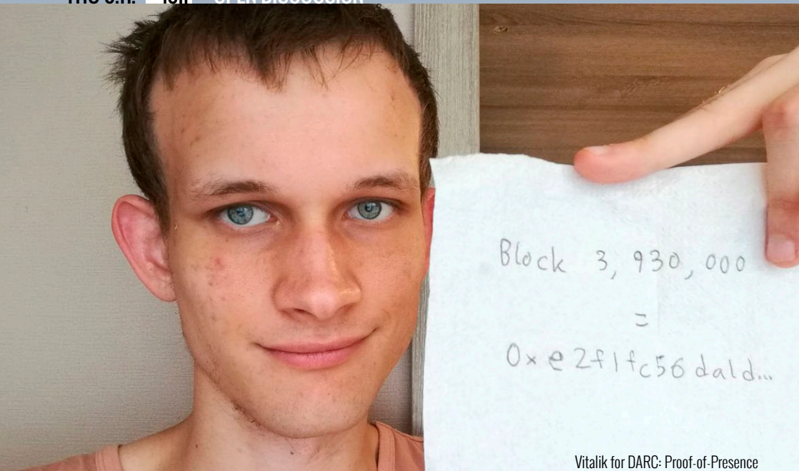
Vitalik for DARC: Proof-of-Presence